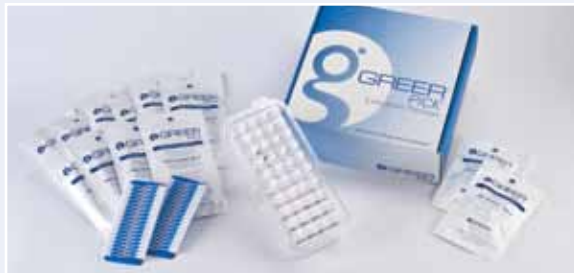
(Limit 3 packages per customer.)