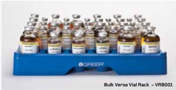
Bulk Versa Vial Rack - VRB001

Two different base sizes allow for a better fit in most refrigerators.