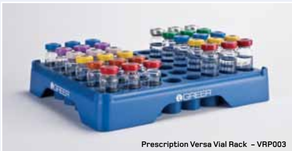
Prescription Versa Vial Rack - VRP003