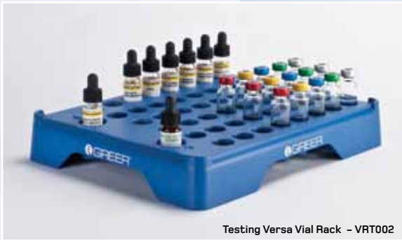
Testing Versa Vial Rack - VRT002